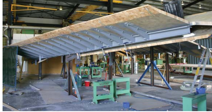
Designed by architect Richard Goodwin, the spectacular 17.5 m roof shape , with a cantilevered section, was modelled on the angular shapes of an F117 jet.

ATL Composites was established in 1977 manufacturing epoxy systems for the marine market.